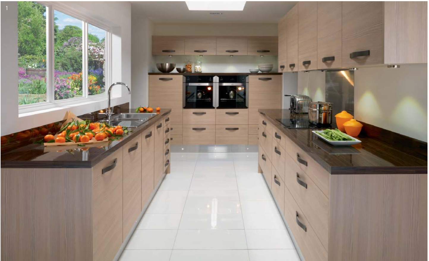
1 Red by Alfred Briggs have released their new Avola range pictured here in champagne. The design opportunities this range has make it ideal to create the feel of open space within the room in a very modern manner. 2 Stunning kitchen featured by Beechview Interiors . This handpainted Neptune in-frame kitchen features a bespoke mantle, windowseat and breakfast bar area.