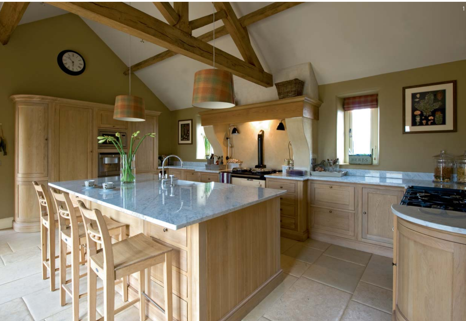
1 The Henley kitchen from Neptune , built from solid oak chosen for its inherent strength and beautiful character ensures these cabinets are built to last a lifetime. Protected to give a timeless look, the Henley kitchen will look crisp and timeless year after year. Pictured here with Suffolk oak bar stools also available from Neptune. 5 Rational high-gloss cappuccino kitchen by Robinson interiors. 3 Solid wood painted and walnut design by Creative Wood Kitchens .