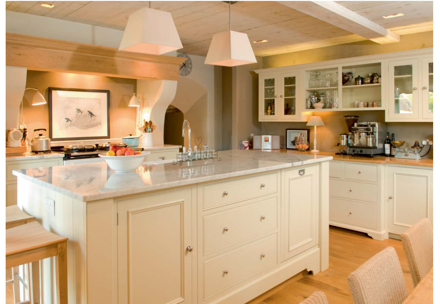
Above left: Painted traditional kitchen with naturally finished hardwood, by Creative Wood . Above right: The Chichester kitchen from Neptune Classics . With a huge choice of cabinets and 20 colours to choose from, every kitchen is entirely different with spectacular ranges in style from very contemporary to beautifully classic. Below left: Hand-painted, in-frame tulipwood kitchen from Celtic Interiors . Below right: A mix of classic bespoke painted and solid American black walnut cabinetry, teamed with feature corbals, from Hayburn & Co .