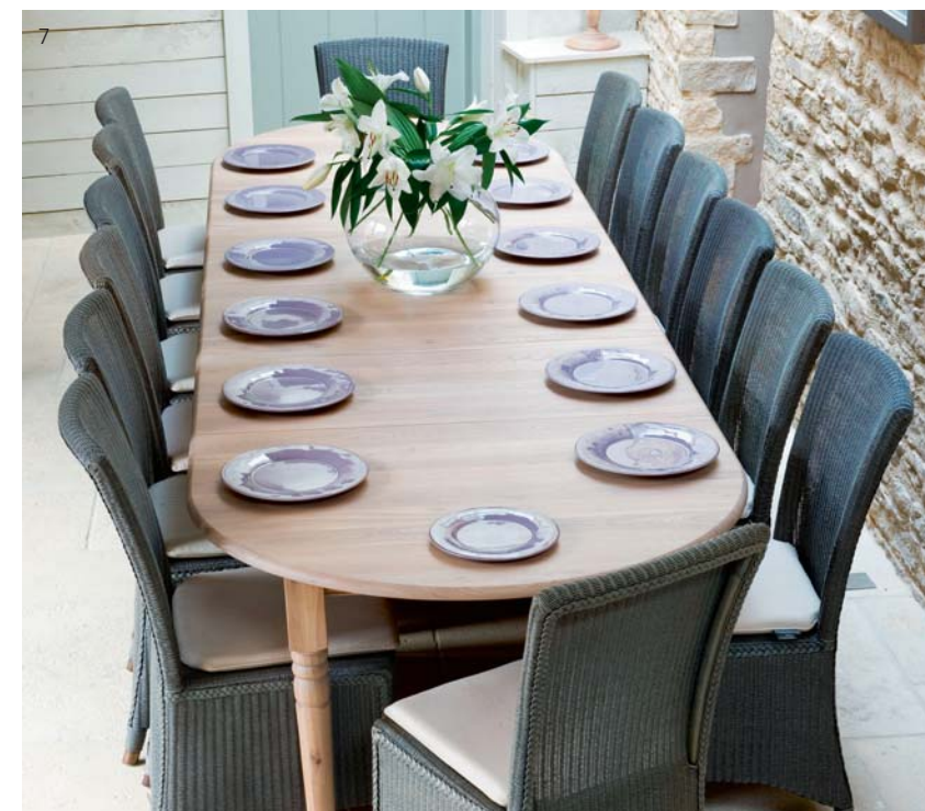
1 Beauty and clean lines with this collection from Robinson Interiors . Prices on request. 2 Gher from Arper is a system of essential and light tables, whose hardwood legs provide a warm and natural feel. The structure, available in four different wood finishes, attaches directly to the top, which is available in an array of measures and formats. Price on request. 3 A sumptuous Calligaris suite from Uno Modern Living . Price on request. 4 Ella chair from Zanotta . Polished or painted aluminium alloy legs in the shade of black or white. Body made of graduated flame-retardant polyurethane foam with steel insert and elastic strips suspension. Removable fabric or leather cover. Price on request. 5 Stunning bespoke Staron table available from Beechview Interiors . Price on request. 6 Beautifully engineered walnut extending table with matching chairs is available in different wood finishes and a choice of fabrics or leather for the chairs. Matching sideboard, wall unit and other occasional items of furniture are also available. All from Elite Lighting . Price on request. 7 Sheldrake table and Havana chairs from Neptune . Celebrating the beauty of ancient oak by reclaiming pieces that show the life of the original tree. Each piece is taken through a careful finishing process to show off its age and peculiarities before being sealed with Neptune isogaurd for the utmost protection. Available in a variety of configurations including the 165-365cm version shown here which can seat up to 16 people, these tables are ready to party! Price £1,250/€1,625 for table and £200/€260 each for Havana chairs.