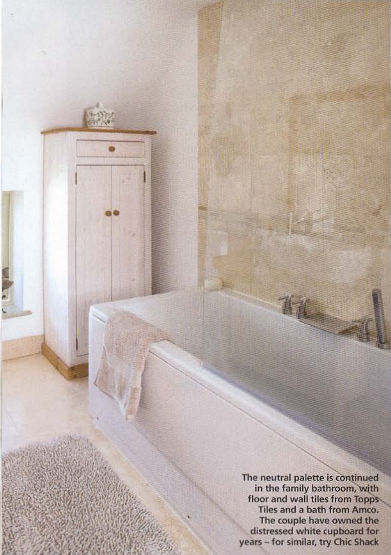
The neutral palette is continued in the family bathroom, with floor and wall tiles from Topps Tiles and a bath from Amco. The couple have owned the distressed white cupboard for years – for similar, try Chic Shack